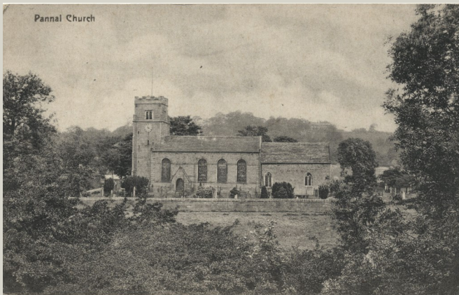
Postcard image of St Robert's Church pre-1914

The clock is an asset for the whole community and has reminded local people of the time for over 200 years; but its three faces have become shabby and it is sorely in need of renovation.